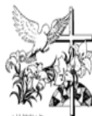
5TH SUNDAY OF LENT

Please remember St. Michael's in your will St. Michael the Archangel R. C. Church 20 Page Ave, Cohoes, NY 12047